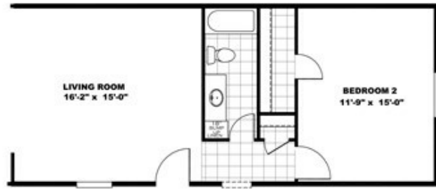
OPT. 2 BEDROOM