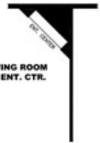
LIVING ROOM W/ ENT. CTRL.

Our home building facilities invest in continuous product and process improvements. Plans, dimensions, features, materials, specifications and availability are subject to change without notice or obligation. Renderings and floor plans are representative likenesses of our homes and may differ from the actual homes. We invite you to tour a Home Center near you and inspect the highest value in quality housing available or call (256) 820-0510 to speak with a Home Consultant. Copyright 2017, CMH. All rights reserved.