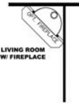
LIVING ROOM W/ FIREPLACE